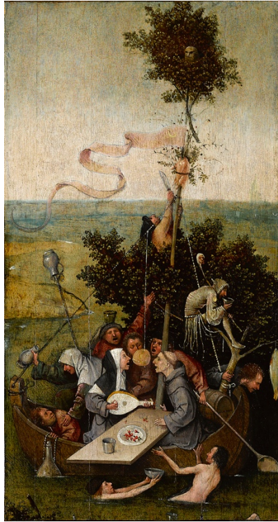
Hieronymus Bosch, 1500-1510 (?)

ivre , is now the planet Earth, two sorts of fools inhabit it, and their relative strength may decide its course and destiny: the money-drunken and the moon-drunken – the ambiguity may be as uncanny as a painting by Bosch, but it may be inevitable.